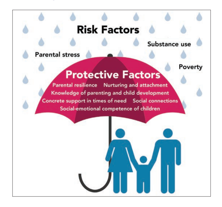
Figure 2. Risk and Protective Factors

For more information, visit Information Gateway's Preventing Child Abuse & Neglect (https://www. childwelfare.gov/topics/preventing/) and Responding to Child Abuse & Neglect (https://www.childwelfare.gov/ topics/responding/) web sections.