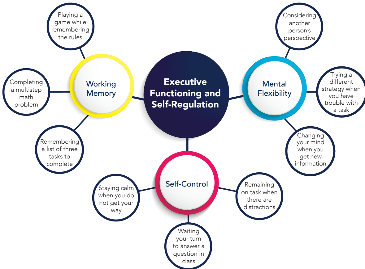
Figure 2. Examples of Executive Functioning and Self-Regulation